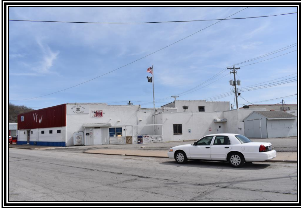
Pony Express Post 359 has it offices at VFW Post 6760 in Saint Joseph, Missouri.

Post 359 held its meetings at its headquarters at VFW Post 6760 in Saint Joseph, Missouri.